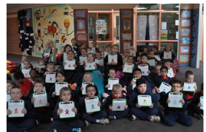
Showing off our new technology.