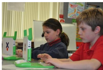
Using the XO to take notes from books.