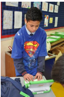
Setting up an art portfolio.

Comments from both students and parents have been extremely positive. Teachers have started to use the XOs for a variety of purposes. Some students have started to create art portfolios while others are using their XO for spelling, reading and mathematics.